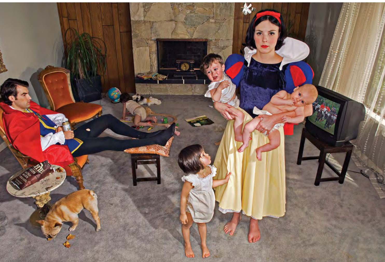
NIKON D3X, 17 MM, F/14, 1/40 S, ISO 200.

culture. Using the visual lexicon of various world religions, she created images to question the materialism often found in today's religious cultures. Shot in different locations, Goldstein says it was an "exhilarating and exhausting series to produce." The set of The Last Supper , for example, was particularly large and involved. Built in ground zero of the Downtown Eastside of Vancouver, the poorest neighbourhood of Canada, this striking tableau features twelve disciples and a dog gathered around a table littered with beer cans and food, which, Goldstein mentioned, "somehow disappeared every so often."