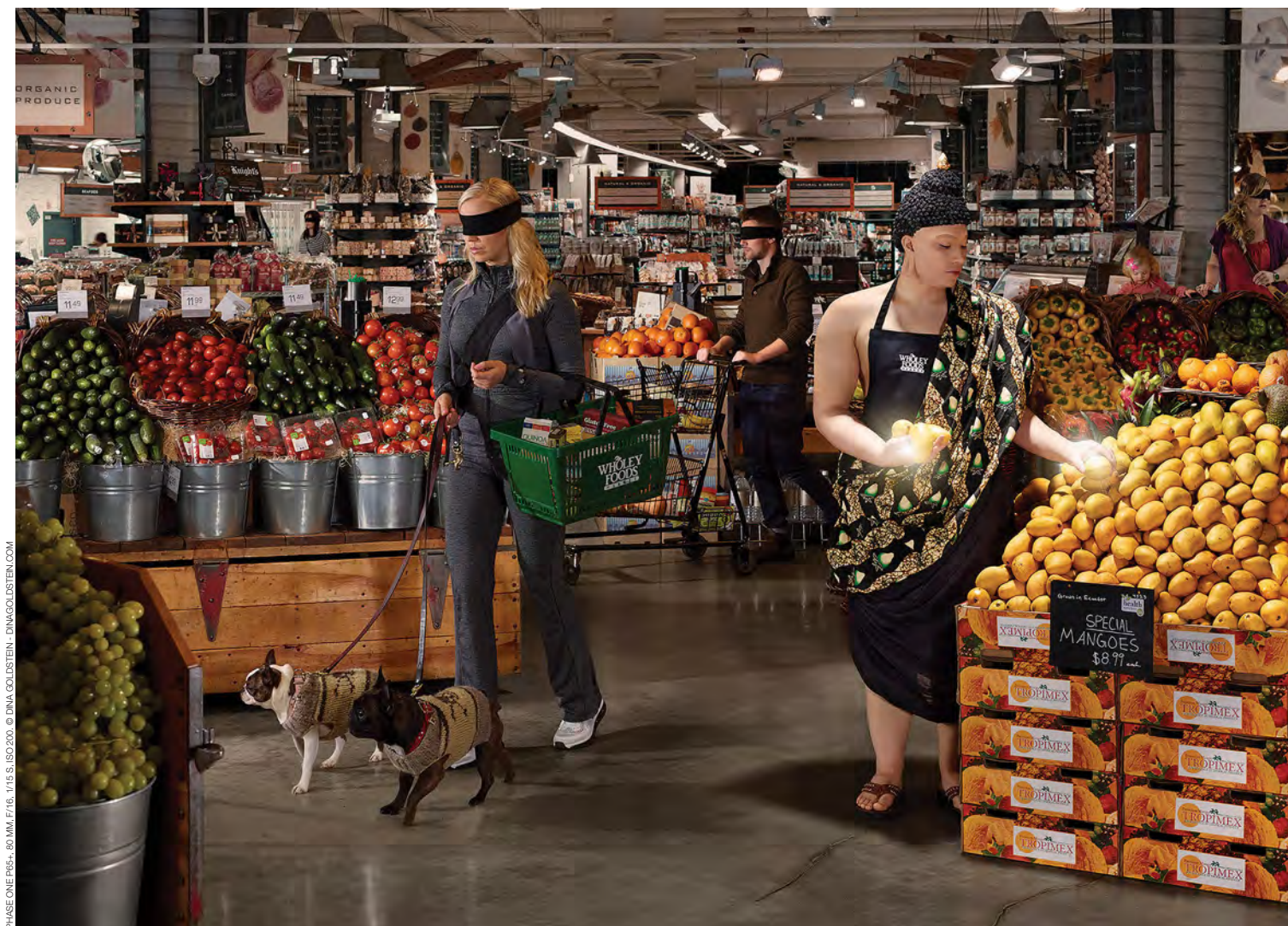
PHASE ONE PMS+ 80 MM. F/16. 1/15 S. ISO 200.