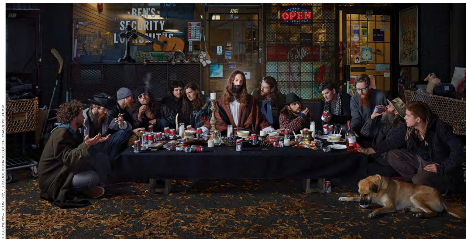
PHASE ONE P65+, 50 MM, F22, 1 S, ISO 100.