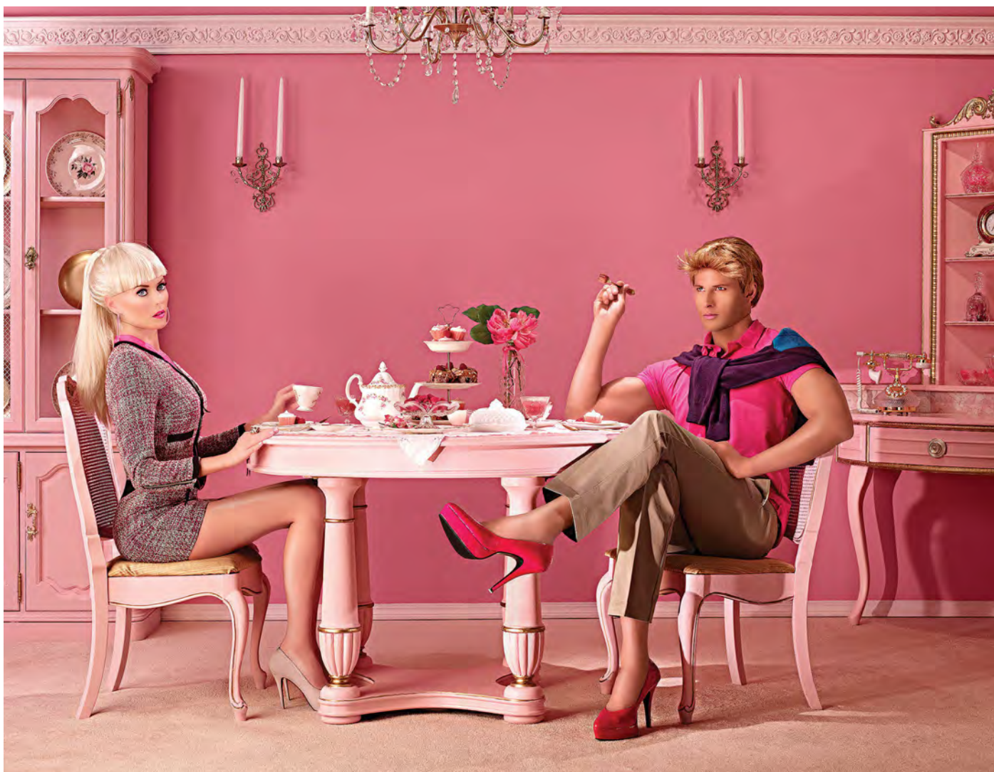
PHASE ONE F45+, 80 MM, F/16, 1/6 S, ISO 200